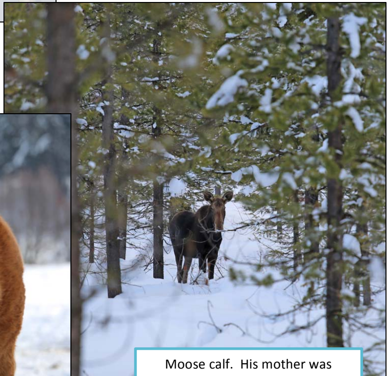
Moose calf. His mother was nearby keeping an eye on him.