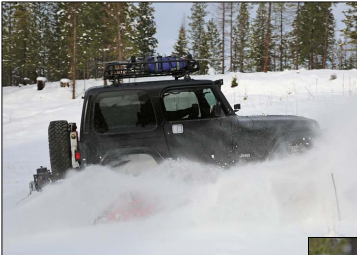
Jeep in the deep snow!